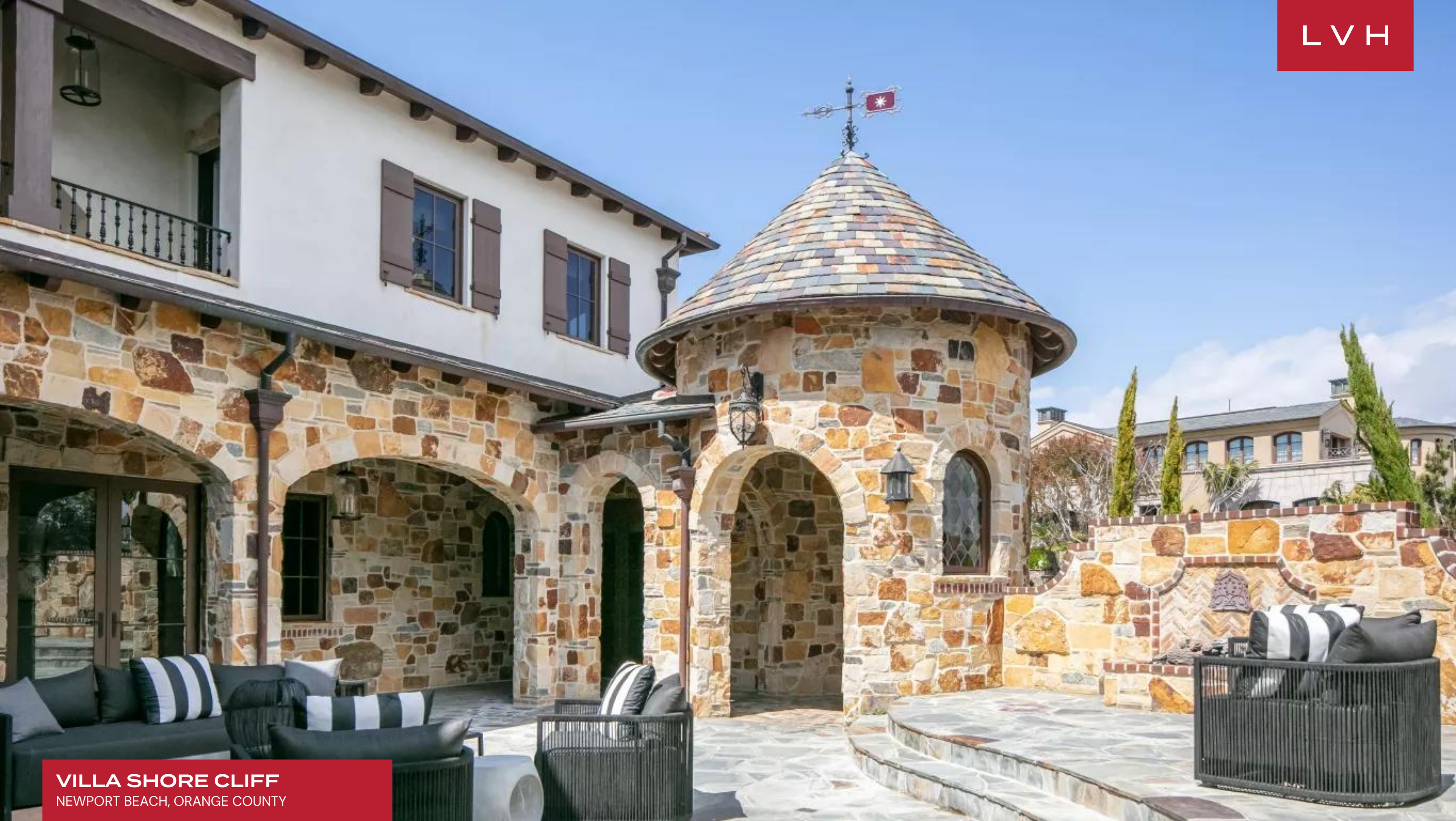
VILLA SHORE CLIFF NEWPORT BEACH, ORANGE COUNTY