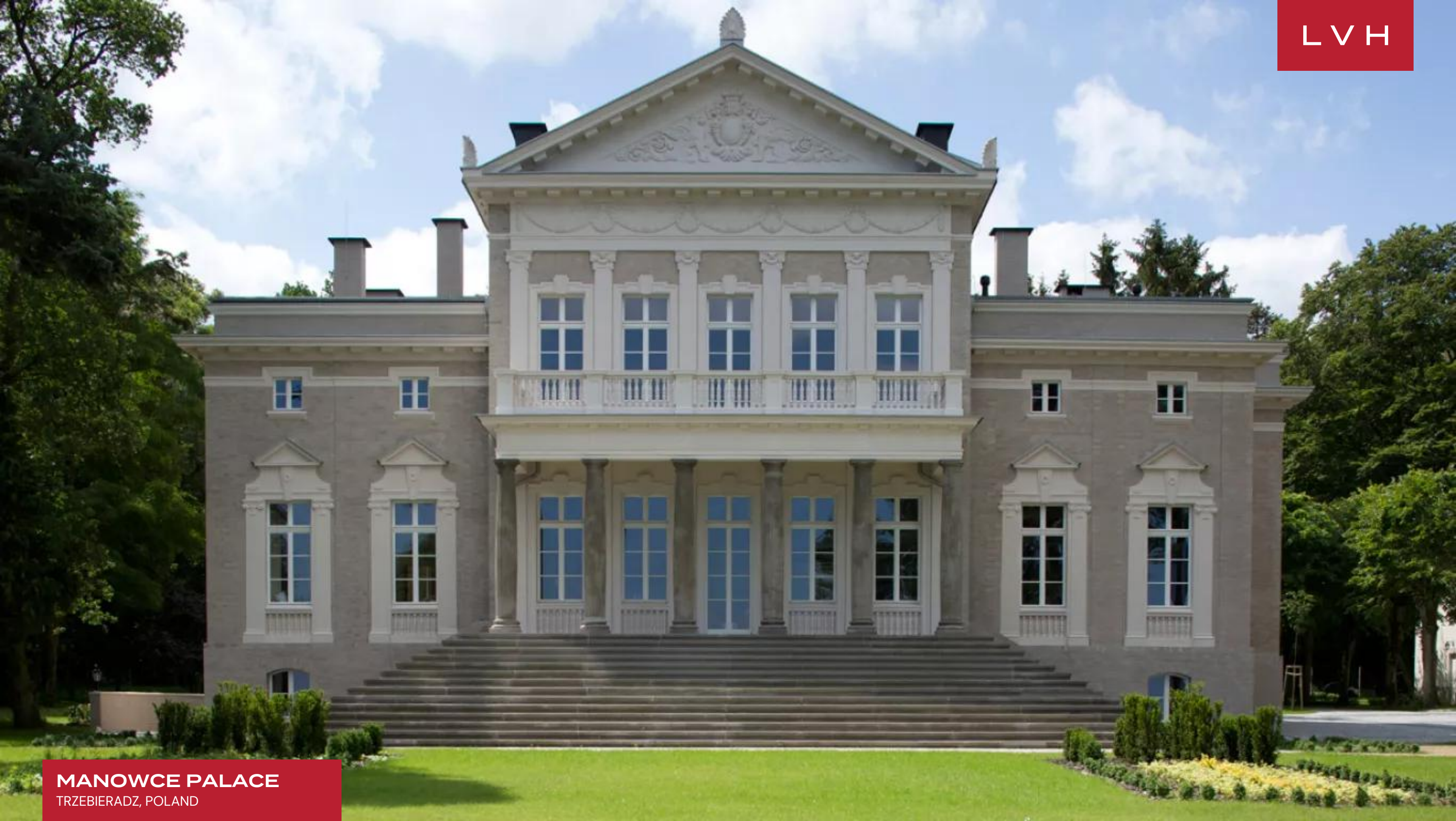
MANOWCE PALACE TRZEBIERADZ, POLAND